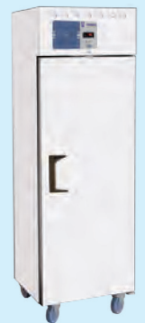
LAB Mini (wheels optional)