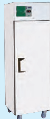
LAB Sani (wheels optional)