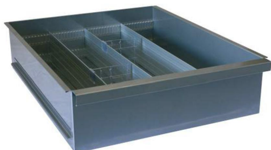
drawer with divider kit DV44